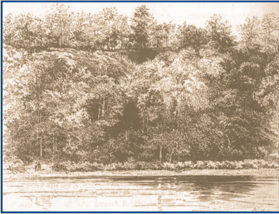
The cliff at Ball's Bluff. From Battles and Leaders II .

Baker ordered his entire 1,700-man brigade to cross the river, which was done in shifts, as there weren't enough boats to go all at once. He waited for a large group to land on the beach and then ordered his men to march up the narrow path without sending any scouts ahead to assess the situation. When Baker reached the top of the bluff and located the Union colonel from the scouting parties that were sent earlier, he shook his hand and congratulated him on finding a battle that they could fight. (Hmmm!) Again, Baker did not send out skirmishers to determine the size of the Confederate force, but he gave orders to have the rest of his men land on the beach. Soon, all four regiments had landed, and Baker had yet to realize his dangerous position. A large group of Confederates were hidden in the woods and had all their cannons in a semicircle, trained on the open field where the Federal troops were amassing. (The Confederates had previously intercepted a Union courier and were aware of Federal intentions.)