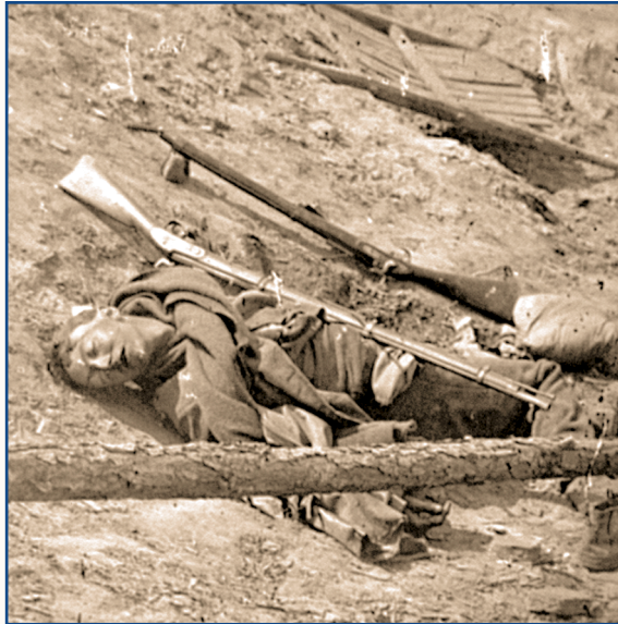
A dead Confederate soldier lies in a ditch after the Battle of Petersburg.

“I have Seen...men rolling in their own blood, Some Shot in one place, Some another....our dead lay in the road and the Rebels in their haste to leave dragged both their baggage wagons and artillery over them and they lay mangled and torn to pieces so that Even friends could not tell them. You can form no idea of a battle field...no pen can describe it. No tongue can tell its horror.”